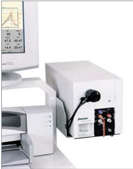
• Jaeger TripleV (30 L), TripleV